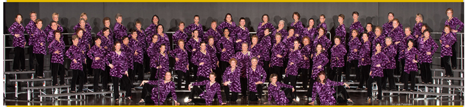
Harmony Region 15 Quartet Champions