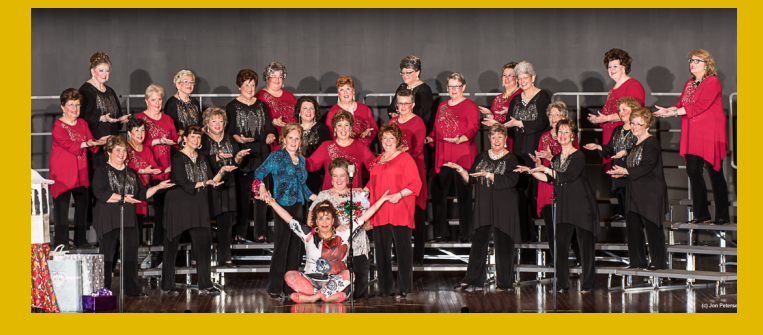
Evergreen Chorus Harmony Classic A 3rd Place