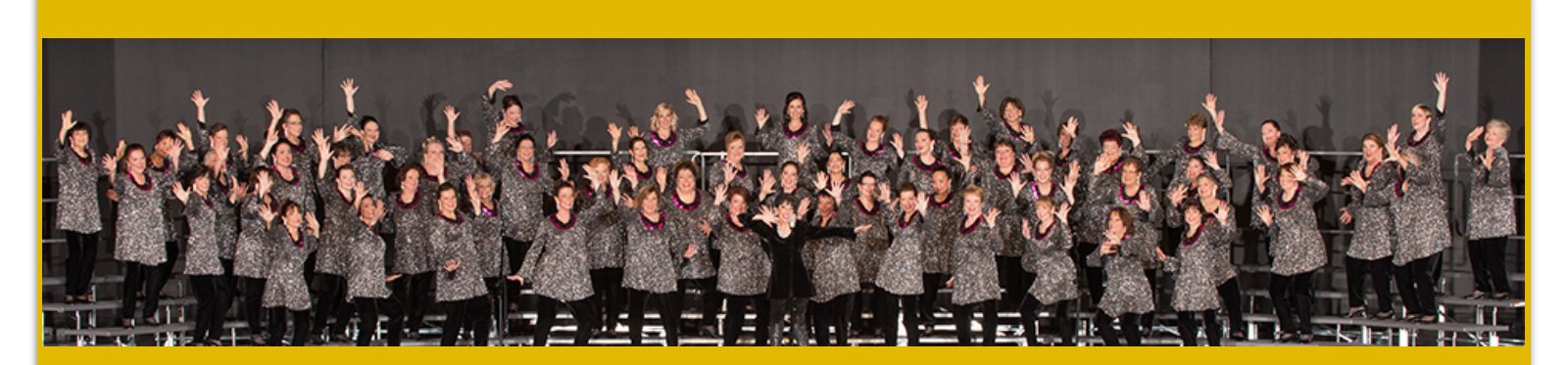
Greater Nassau Chorus International Medalists 7th Place