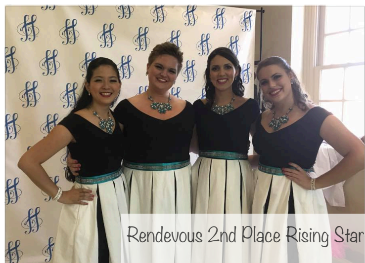
Rendevous 2nd Place Rising Star