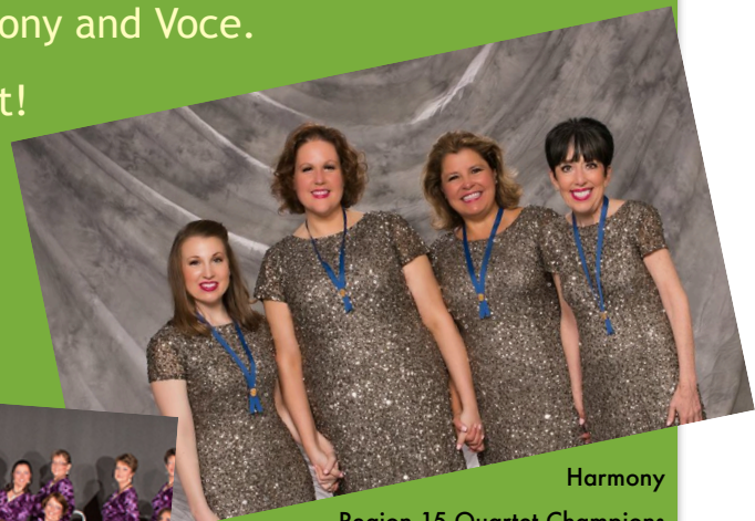
Harmony Region 15 Quartet Champions