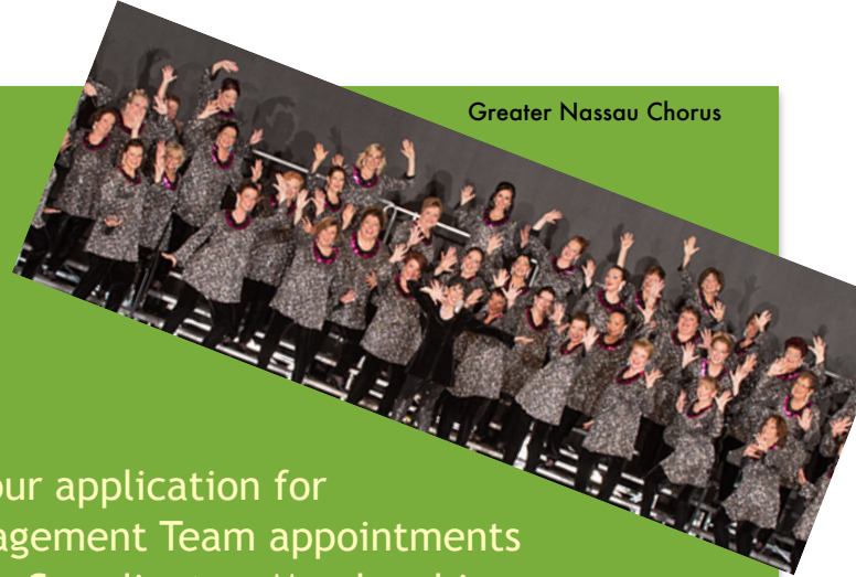
Greater Nassau Chorus