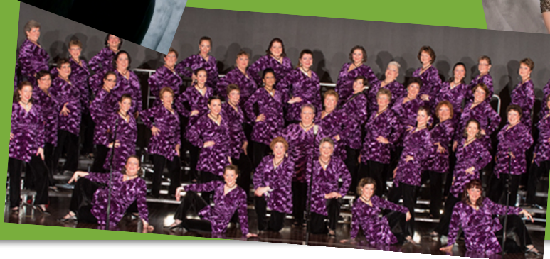
Spirit of Syracuse Chorus