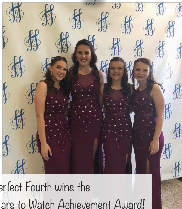
Perfect Fourth wins the Stars to Watch Achievement Award!