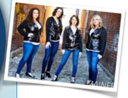
2011 BHS Gold Champions Old School Quartet

With Special Faculty & Guests 2014 Rising Star Champions 8th Place International Quartet Class Ring Quartet