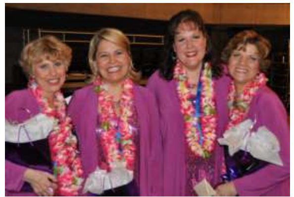
Getting to know One Track Mind!

One Track Mind is honored to be representing Greater NY/NJ Region 15 along with Drive! and a.k.a Quartets in Hawaii this November 2013. We are so excited to be a part of our new region! Being brand new, we wanted to take the opportunity to introduce ourselves.