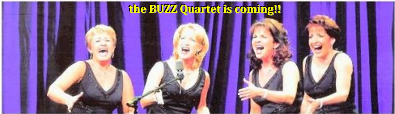
the BUZZ Quartet is coming!!