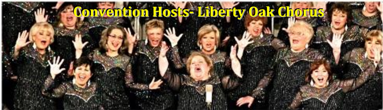
Convention Hosts- Liberty Oak Chorus