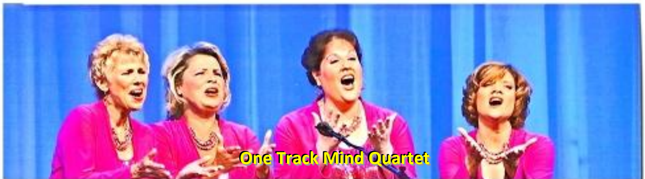
One Track Mind Quartet

For information go to: www.sairegion15.org