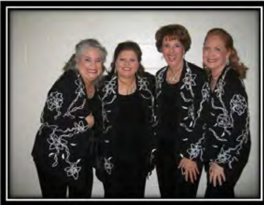
The Four Baris

Greater New York Region quartet photos taken upon exiting the stage