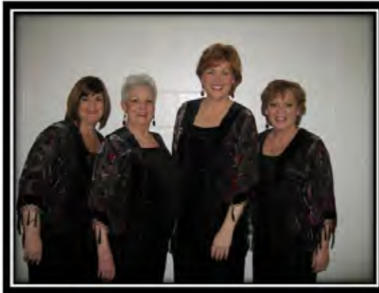
Just 4 (Kicks)