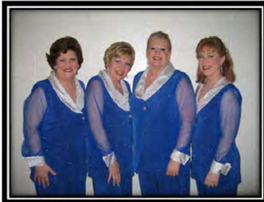
Three Quarter Time