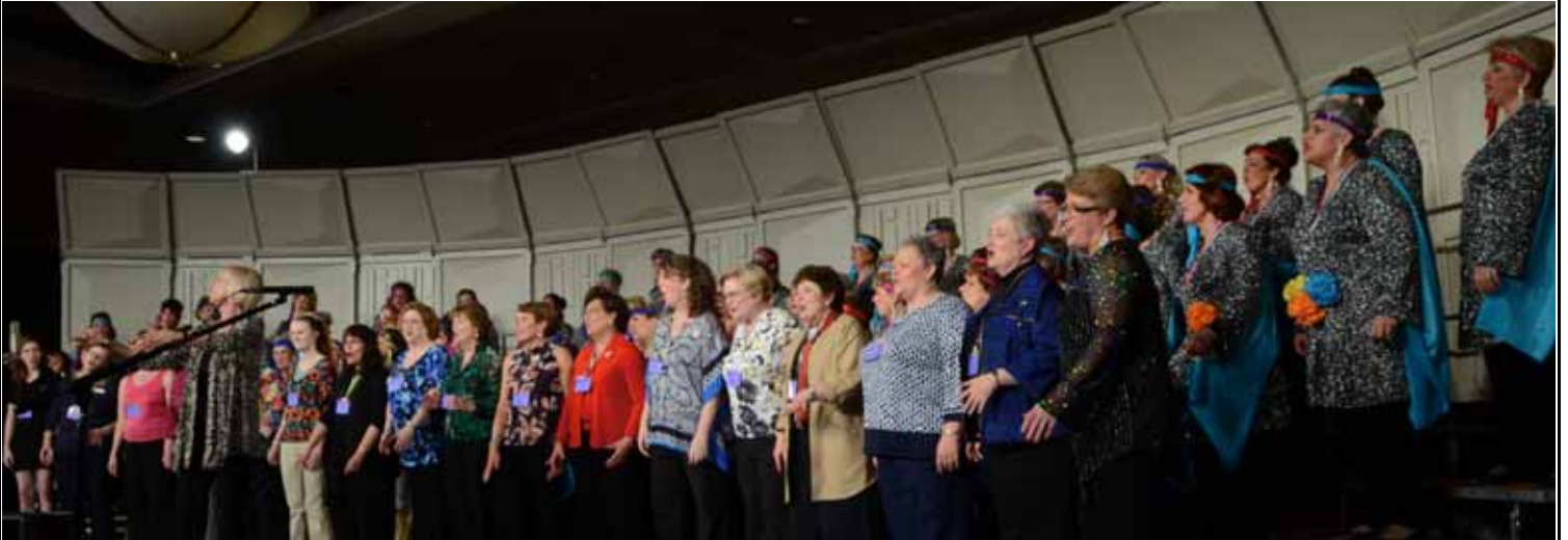
We Are All Sisters In Harmony!