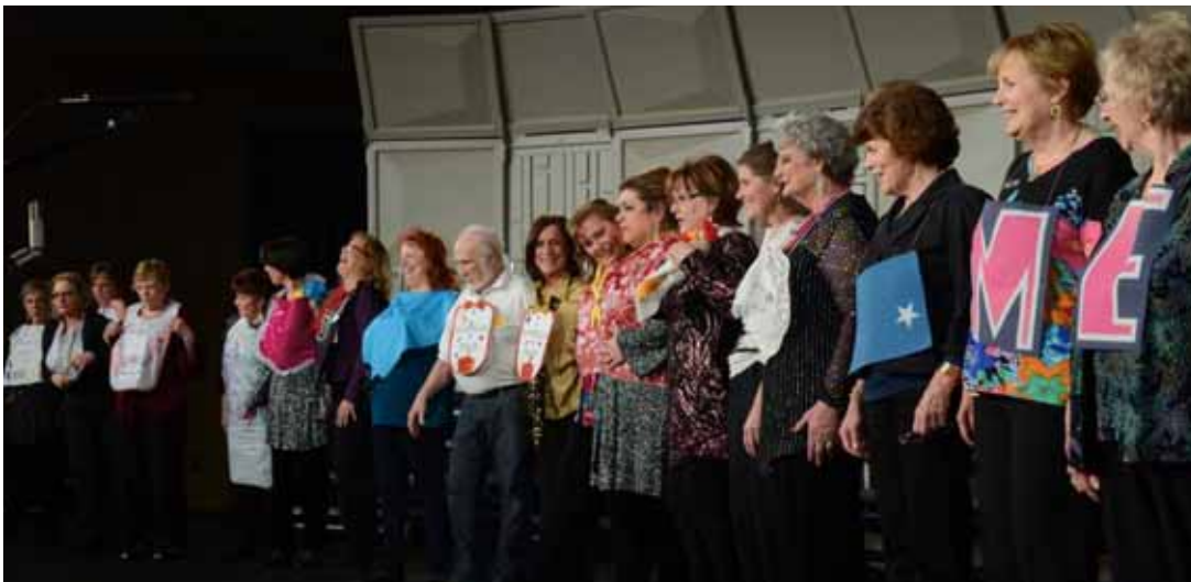
A Fabulous Bib Contest!

Wow! What a fabulous dinner party we had this year! The food was plentiful and the entertainment, just fabulous! Can you believe there were over 450 people in attendance? We sure had fun with that Bib Contest and Sweet Adelines Match Game. Can't wait until next year!!