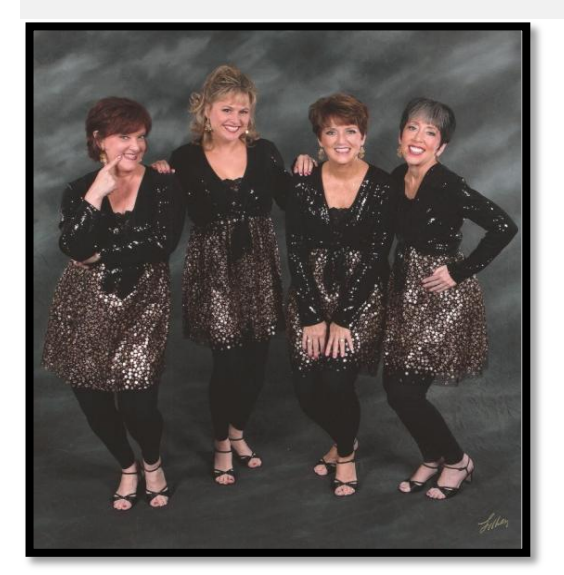
a.k.a. Quartet 2012 International 3rd place winners

Saratoga Soundtrack - Contestant #2, Tuesday October 30, 2012 at 8:38p.m. East Coast Style Quartet- Contestant #31, Wednesday October 31, 2012 at 7:45p.m. a.k.a. Quartet- Contestant # 42, Wednesday October 31, 2012 at 9:55p.m. Liberty Oak Chorus - Contestant #11, Thursday, Nov. 1, 2012 at 3:15p.m. Harmony Celebration Chorus - Contestant #14, Thursday, Nov. 1, 2012 at 3:54p.m.