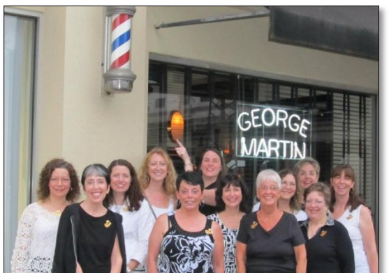
SAI Day with Greater Nassau Chorus in Rockville Centre

Greater Nassau Chorus had the privilege of participating in Sweet Adelines International Day on Friday, July 13. Two quartets, Turning Point and Sound FX, as well as a small group including